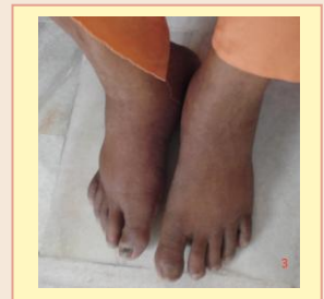
Lotus feet of Gurudev